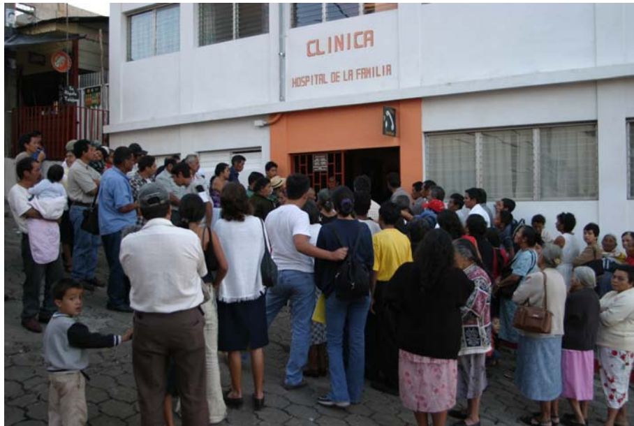
Patients beginning to line up for clinic at 6AM.