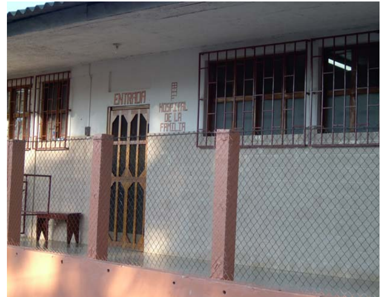
The hospital and operating room main entrance.